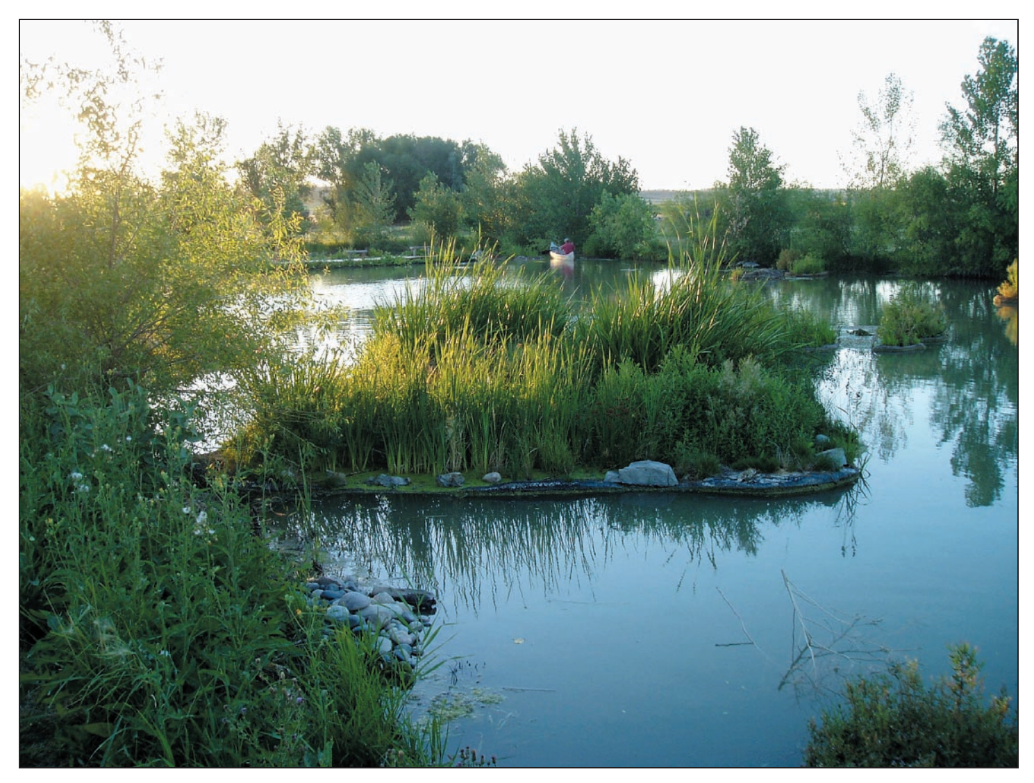
Another example of a floating island. This one is used for vertical landscaping with native plants.

manufactured floating islands is to take the best from what nature has done, copy it and make it available to those who need and want it.