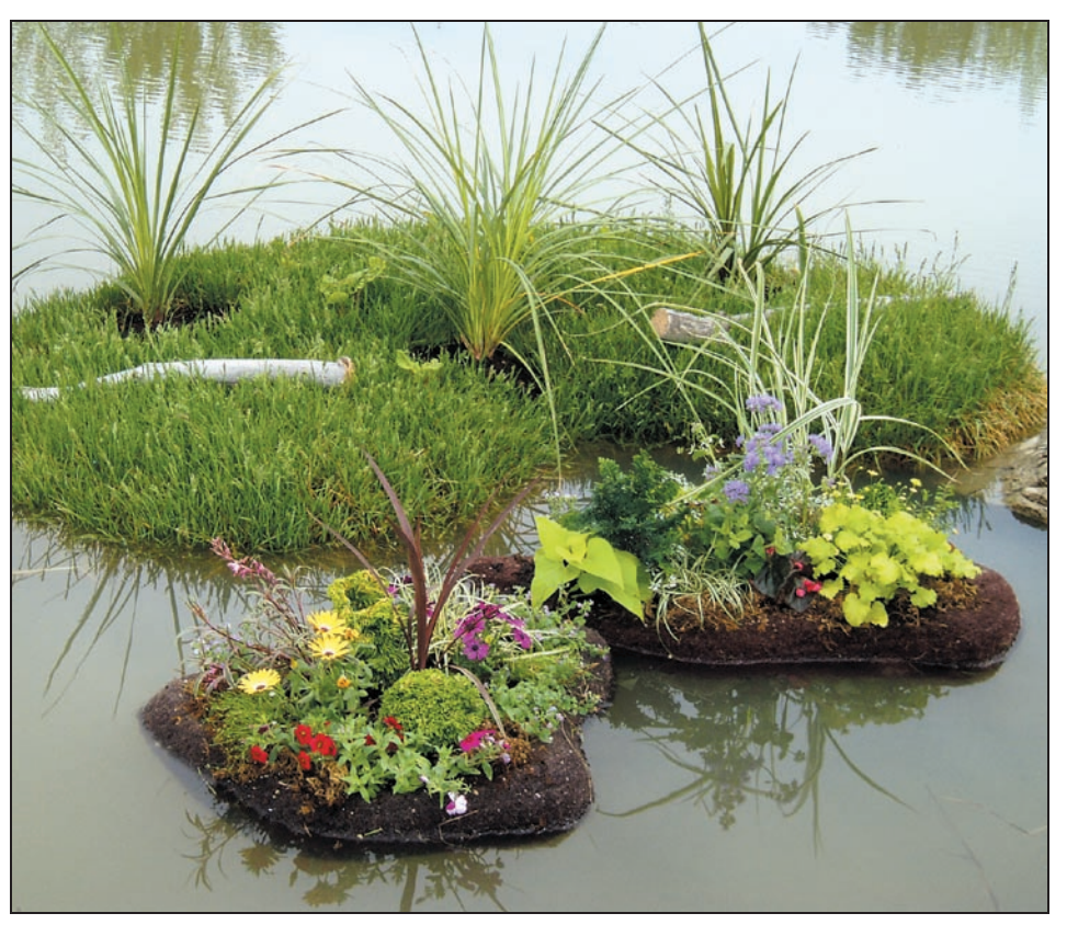
Three different islands, attached with cables and anchored, decorated.