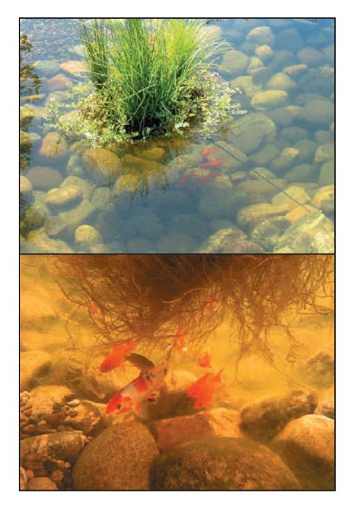
Top. Here's a small island, designed for backyard water gardens. Notice the goldfish underneath, nibbling on root mass. Bottom. An underwater shot of goldfish hiding underneath a small island.