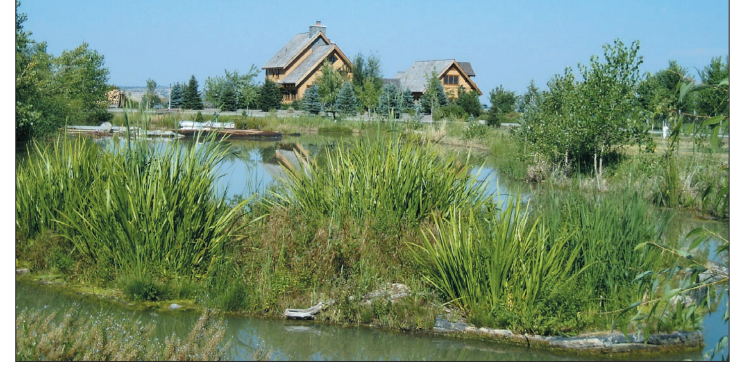
Above. This decorative floating island has been planted with a variety of shoreline and bog plants. Right. This floating island has been planted with a variety of native plants. It covers approximately 250 square feet.

humans are pretty arrogant to believe we can have a rapid influence on the climate. With that, he pulled out a plastic bookstore bag, handed me a brand new book called, "The Weather Makers" and made it mandatory reading. He explained, "As editor of a magazine, you have influence. Your thoughts are important. I think you should educate yourself about global warming." The calm, conservative republican inside of me remained skeptical. The screaming scientist inside said, "Read the book." Then, go find another book, and read it. Then, ask questions of knowledgeable people and report the findings.