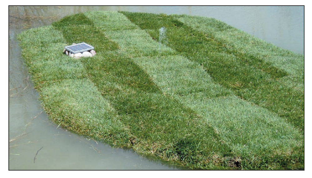
Imagine looking on your pond and seeing turfgrass growing in the middle. One enterprising pondmeister bought an island, sodded it, and drives golf balls toward it. Why?