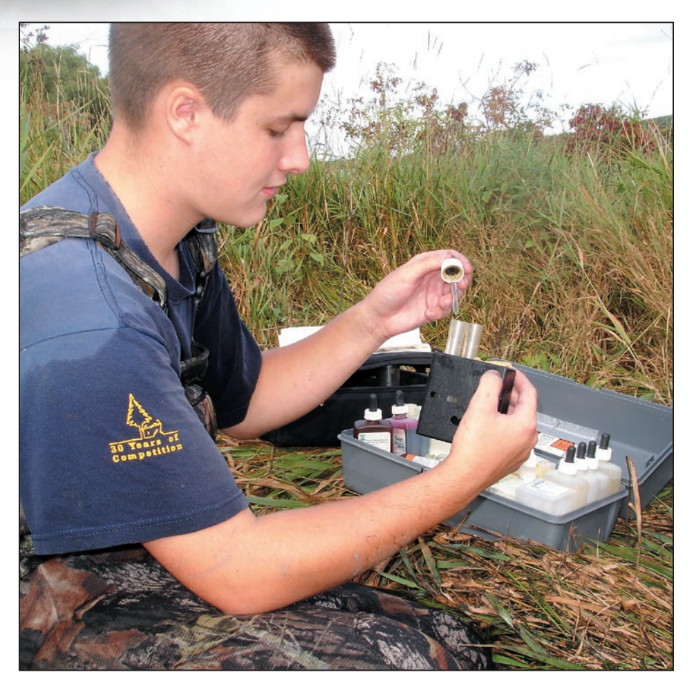
A popular water chemistry analysis kit is this model, designed for fish farmers and manufactured by Hach.

What about pH? Trust me, you do not want the textbook definition of pH. All you need to know is that pH is a measure of how acidic or