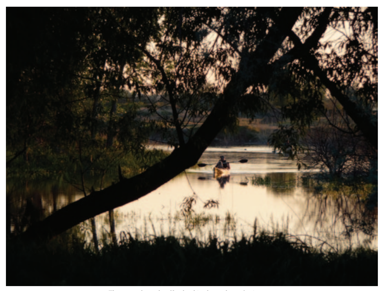
The research pond at Shepherd is also a place of enjoyment.

4. The window makes it clear, pun intended, that phytoplankton is a primary cause of low visibility in the pond water. By moving some of this phytoplankton right along the bus to become periphyton, we improve water clarity.