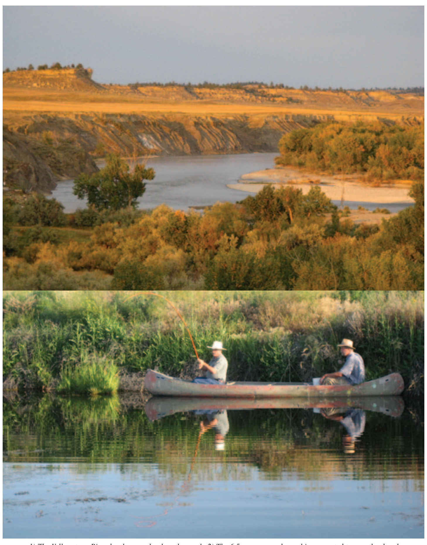
1) The Yellowstone River borders our land on the south. 2) The 6.5 acre research pond is connected to a wetland and provides some fun recreation.