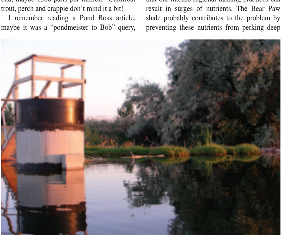
This is the observation blind with a window toward the bottom of it in 11 feet of water.

So you can see the problem. Plenty of cool water but it's stratified, just like almost every other pond in the nation. Trout would cook on top, suffocate below.